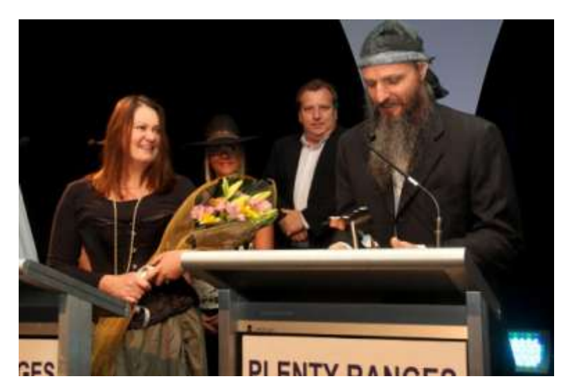
Victorian Music Awards Presentation 2011

No1 on the 2011 Air It Folk & Country Charts (for radio airplay)