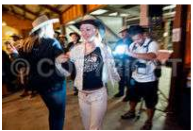
Guests whooping it up!